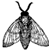
Figure 2: A sample black and white graphic that has been resized with the includegraphics command.